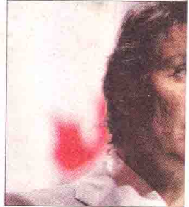
Canadian Prime Minister Justin

Trudeau said that he thinks it is "extremely important" that Canada and its allies continue to engage "constructively and seriously" with India given its growing importance on the world stage.